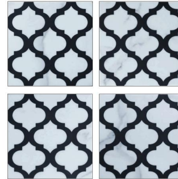
HL 1067 PC 04

Suitable for all types of wet & dry Areas.