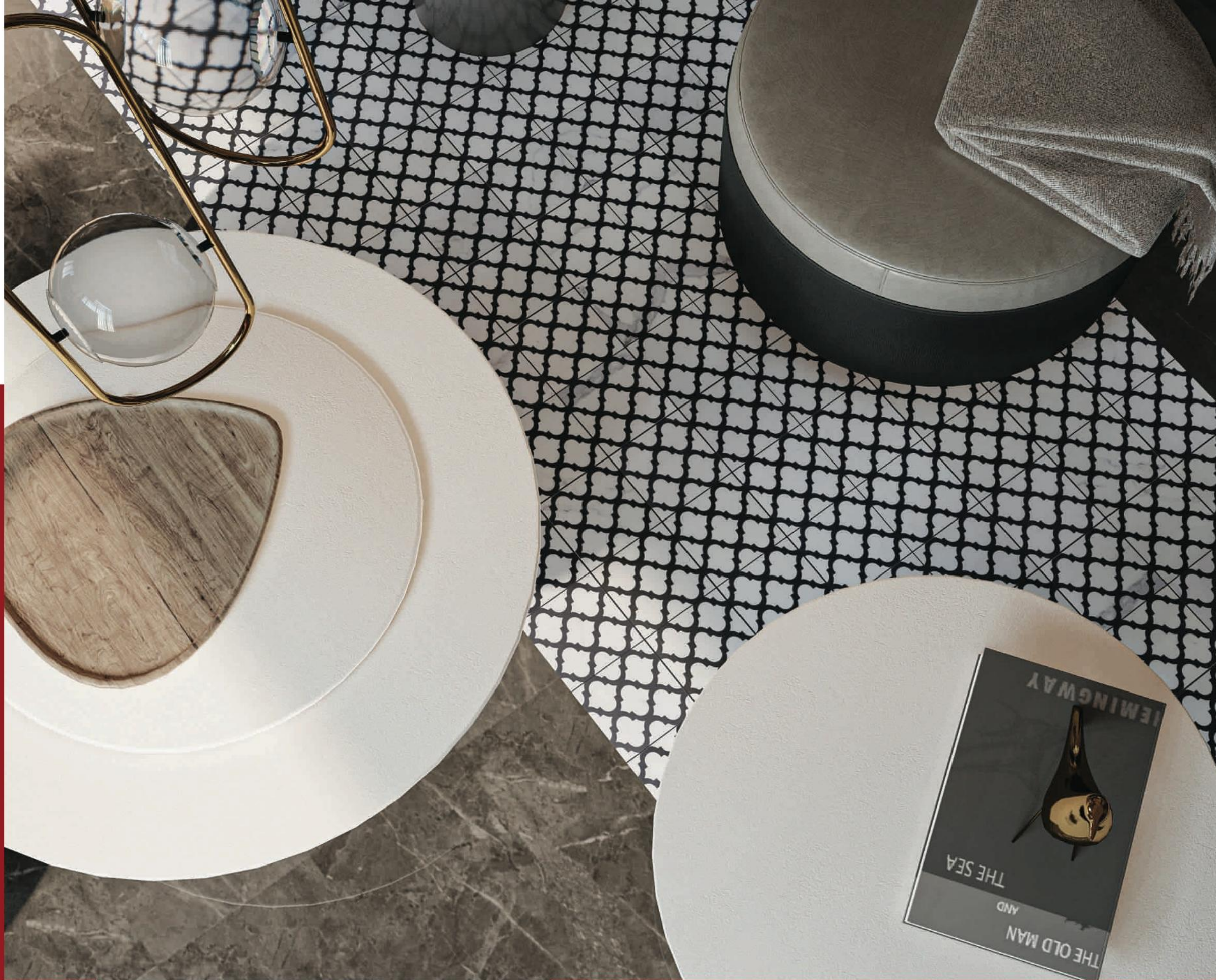
IMAGE Single Pattern

Classic white Statuario marble base tiles hand decorated with traditional "TULARI" with an option of deep matt black & embossed white glaze. Create beautiful luxury surfaces in any setting with these stunning decors.