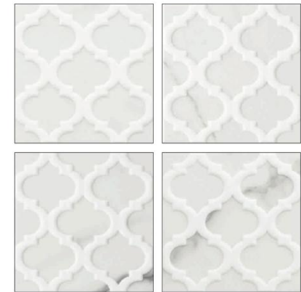
HL 1075 PC 04