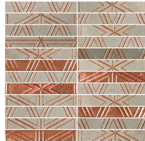
XM 3305 PC 12