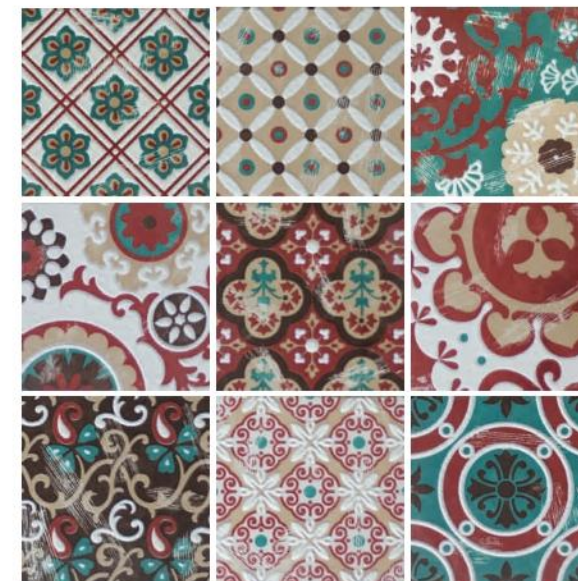
HL 4437 PC 01