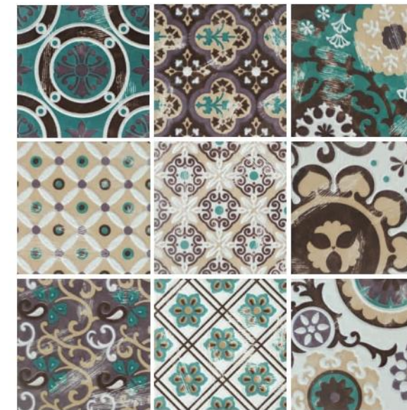
HL 4432 PC 01

Suitable for all types of wet & dry Areas.