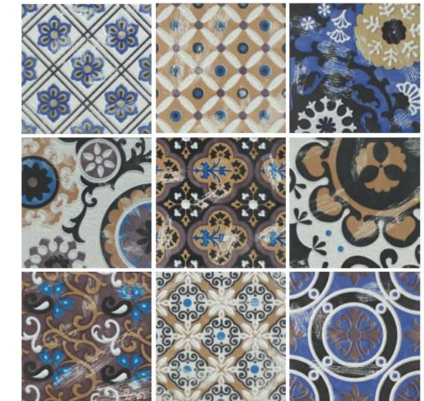
HL 4435 PC 01